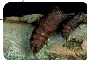
June – July Pupae