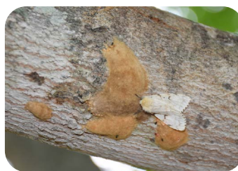
July – April Eggs

Adult males: Greyish-brown with dark markings and can fly and survive about one week, mating with several different females.