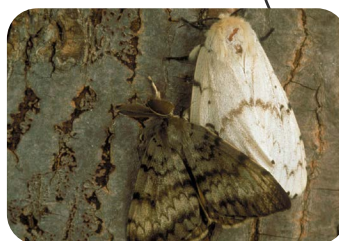
July – August Adult Moths