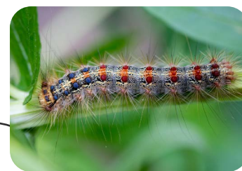
April – June Larvae (Caterpillars)