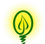
ECOGEN ENERGY & BUILD