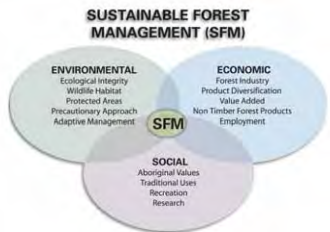
Diagram 1: Sustainable Forest Management