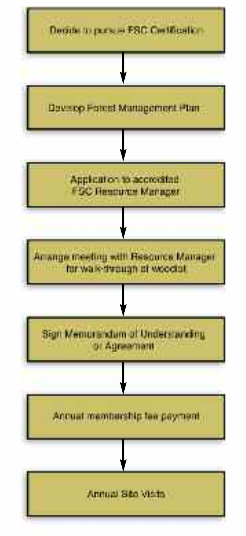
Diagram 2: The FSC Forest Certification Process