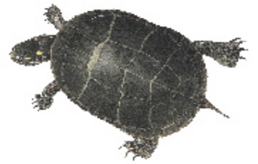
PHOTO CONTEST ON EASTERN ONTARIO REPTILES & AMPHIBIANS